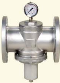
DIRECT-ACTIVATED PRV S.S.316