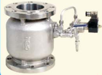
SOLENOID CONTROL VALVE