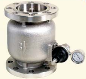
PRESSURE REDUCING VALVE