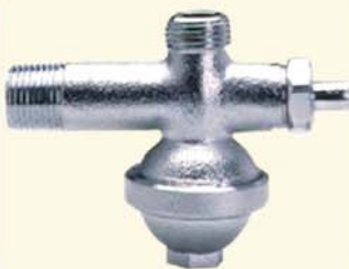
ANGLE STYLE WATER HAMMER ARRESTER