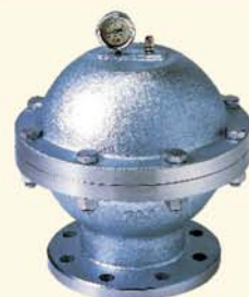
I STYLE WATER HAMMER ARRESTER