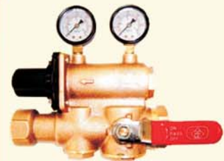
PRESSURE REDUCING VALVE SET