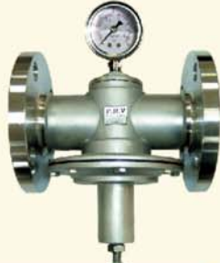
LOW PRESSURE TYPE DAPRV-S.S.316