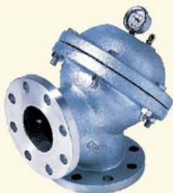
L STYLE WATER HAMMER ARRESTER