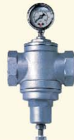
DAPS/BACK PRESSURE VALVE